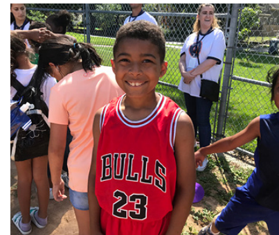
Bright Futures: K-5 Enrichment at PCYC