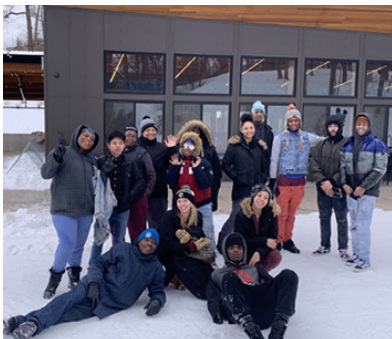
PYC Arts & Technology High School

Due to the COVID-19 pandemic, PCYC's normal educational, youth development and arts programming was either discontinued, moved to another location, or converted to distance learning formats in March 2020. Despite this disruption, the following results for the 2019-20 school year show that our programs and the youth we serve continued to thrive.