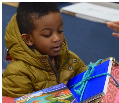
PCYC Annual Children's Gift Sale (2019)